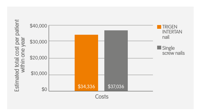
Figure 1. Total cost per patient within one year of care.

• The model estimated greater gains in quality-adjusted life years (QALYs) and avoidance of complications for TRIGEN INTERTAN nail versus single screw nails (Figure 2)