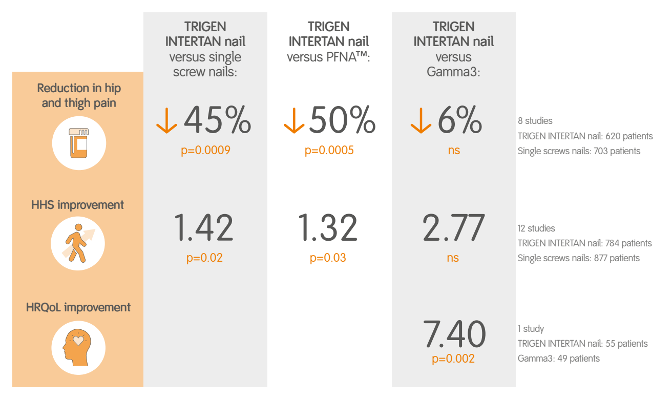
Figure 2. Postoperative functional outcomes, hip and thigh pain, and HRQoL. ns: not significant.