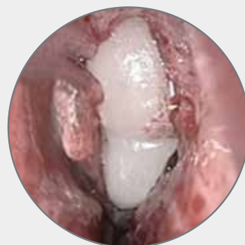
SINU-FOAM Intra-op view