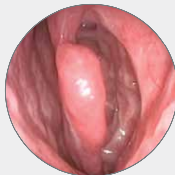
2 weeks post-op