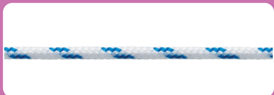
#2 ULTRABRAID Suture