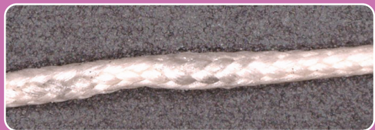
#2 Vicryl Suture