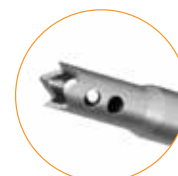
Crown Tip Drill Guide XL