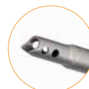
Spike Tip Drill Guide XL

For more information, contact your sales representative or visit smith-nephew.com .