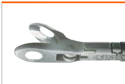
SERPENT Articulating Grasping Forceps, 3.0 mm