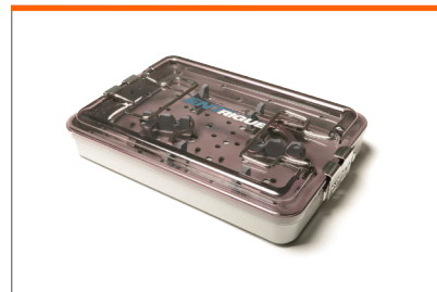
SERPENT Sterilization Tray, holds two instruments in each tray